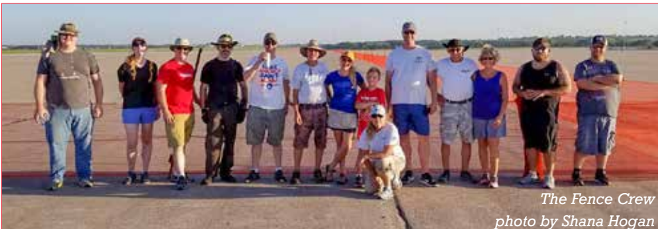
The Fence Crew

Complete results available at https://www.scca.com/events/1990310-18-tire-rack-solo-nationals & https://www.scca.com/events/1990264-18-tire-rack-prosolo-finale