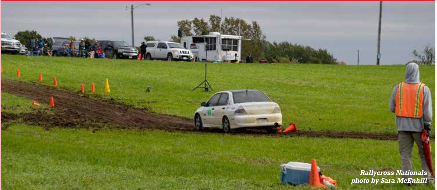
Rallycross Nationals